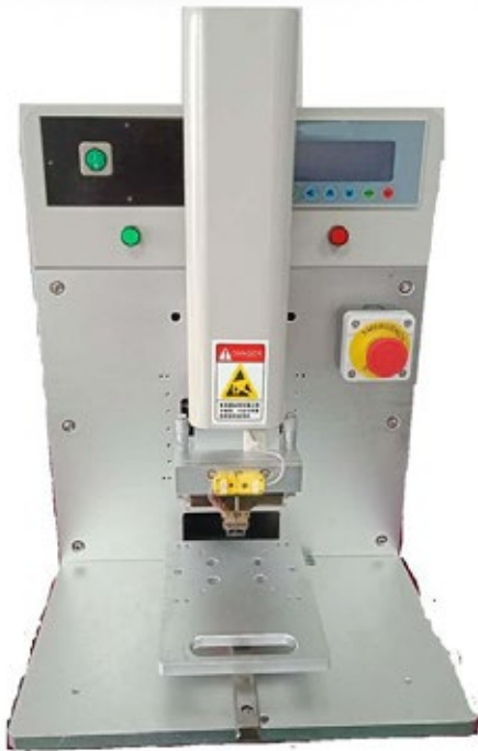
HBS-4AT Can handle PCBs up to 150*150mm